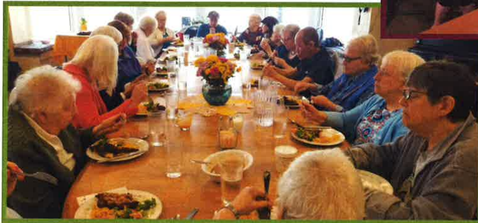
(Left) Seniors enjoying a meal prepared by students from the Hartford Vo-Tech Culinary Arts program at our April birthday luncheon.