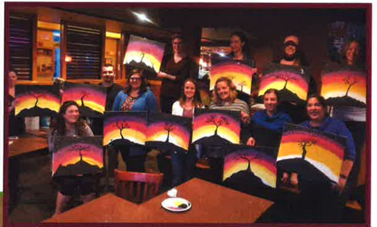
(Right) Attendees at our March Hanover Brick & Brew Pizza & Paint class showing off their artwork.